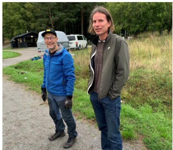
Patu and Poutsa in the parking lot.