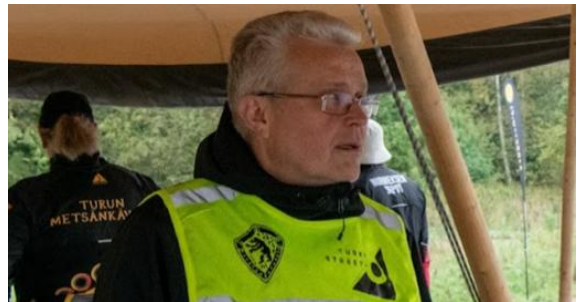
Seppa gathered volunteer crew.