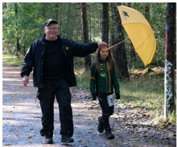
Epo had plenty of experience.