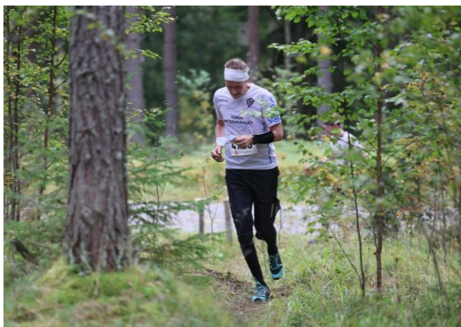
Lergo placed 13th in the H65 class, 5,9 km final.